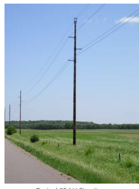
Typical 69-kV Circuit

Transmission line construction will generally use single wood poles 70 to 80-feet above ground, placed 350 to 400-feet apart. Some specialty poles and longer or shorter spans may be required. Directional changes or angles will require guy wires and anchors to stabilize poles. To provide a safe construction, operation and maintenance area, a 70-footwide right of way, 35-feet each side of the centerline, will be cleared of trees and vegetation.